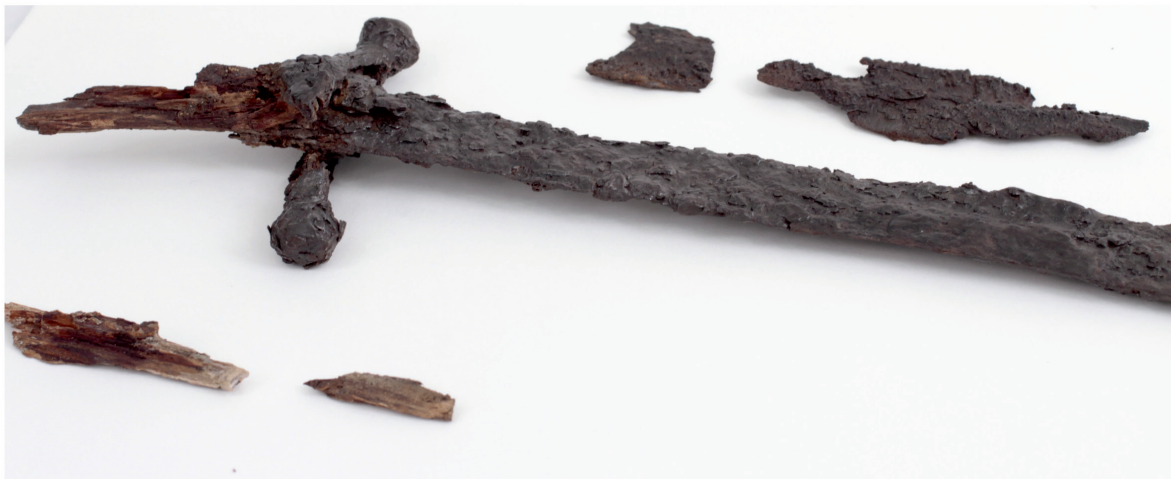
Fig. 3. The saber after the conservation process

not in the grave). Between the right ankle and the eastern side of the pit there was a hoof of a little horse (maybe a foal?). Therefore, the 17th grave is maybe a grave with a partial horse burial.