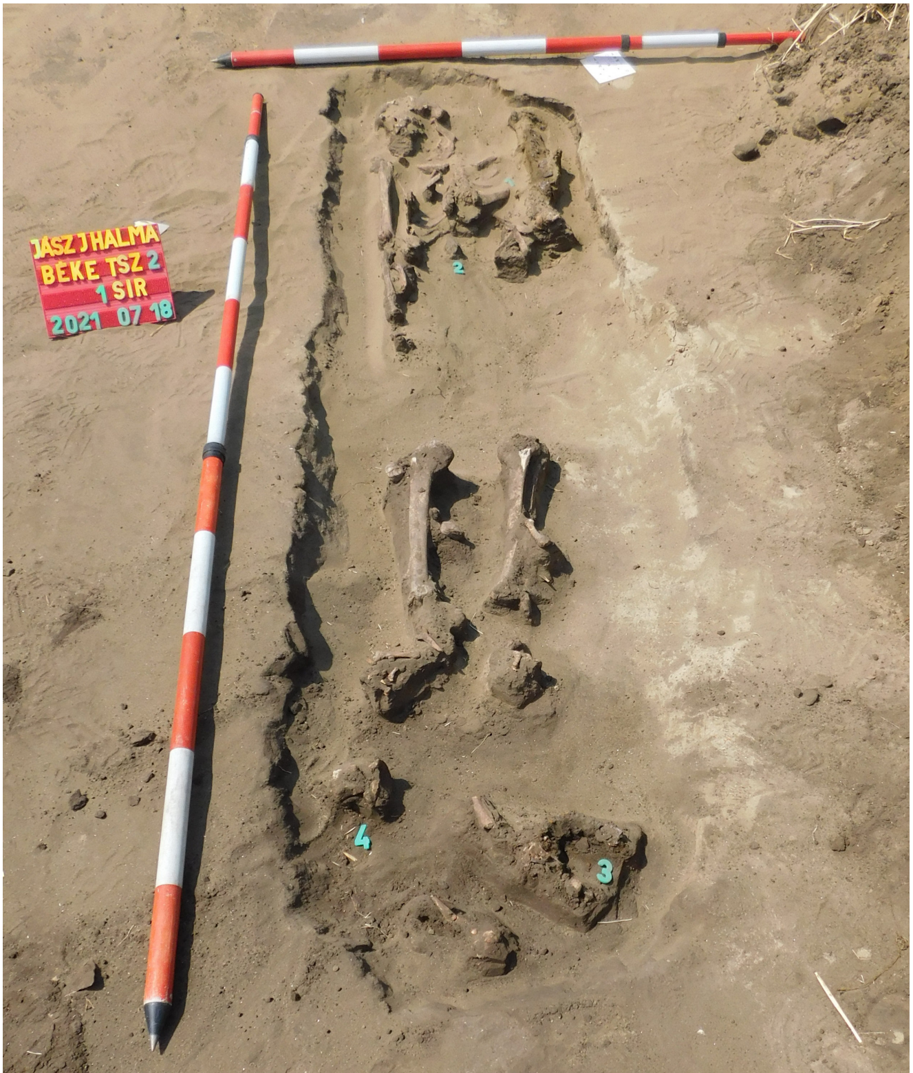
Fig. 1. Photo of grave 17, Jászfákóhalma, Béke TSZ II.