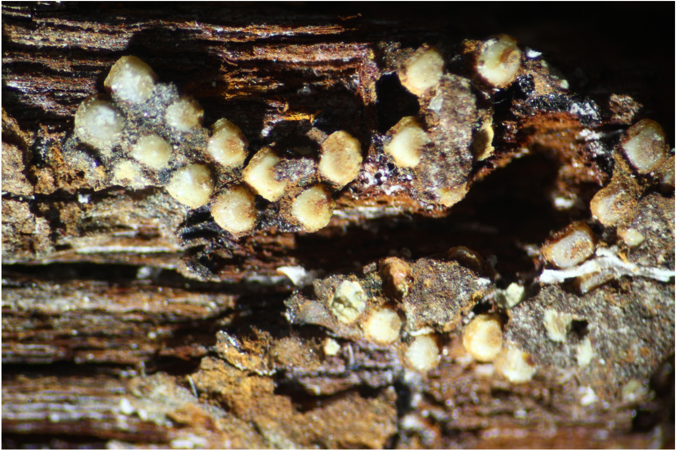
Fig. 5. Macrophotography of the skin remains

Basin and the Indian Ocean, Persian Gulf, and/or Red Sea (or between this places, and one of the previous living areas of the early Hungarians). The 17th grave of Jászjákóhalma, however, seems to be poor. Even though not every Hungarians were buried with a horse or a weapon, the value of the grave goods does not refer to a man with high prestige. But if the fish skin is ray or shark, then it indicates that the lower classes of society could also afford this import commodity, not just the higher classes. If the skin turns out belonging to a Russian sturgeon, then that is also an interesting situation. As they could get this type of fish from the local rivers (in Eastern Europe or in the Carpathian Basin as well), it can indicate the fact that the early Hungarians fished regularly. Currently we have no archaeological evidence on fishery of the early Hungarians (except some bones which can be identified as parts of a fishing web). On the other hand, we cannot exclude that this type of fish skin was also accessible by trade.